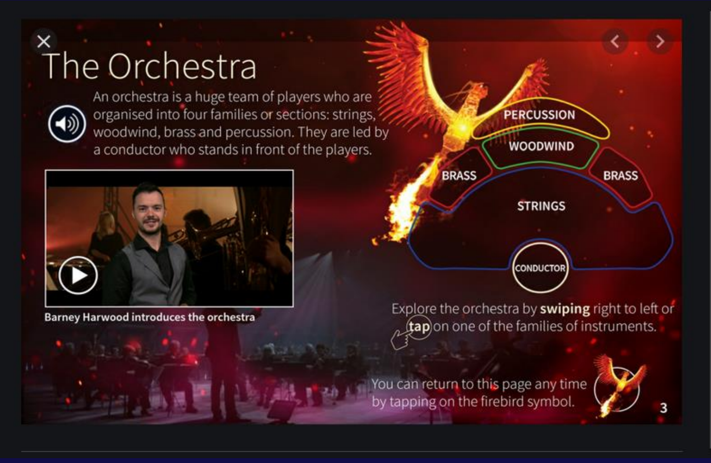
Note - you need your screen in landscape