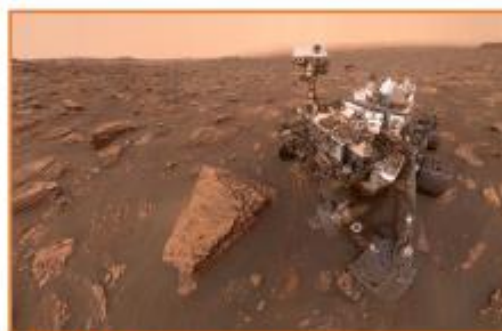
A self-portrait taken by NASA's Curiosity rover.

radiation – Energy emitted by the Sun, some of which is dangerous to humans when not absorbed by the atmosphere of a planet.